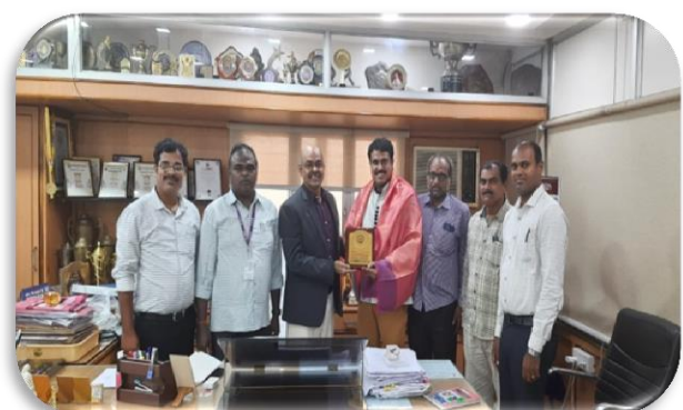
Felicitation to the Resource Person